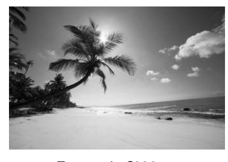
From only €699 pp

Contact your travel agent or book direct on +220 79642 311